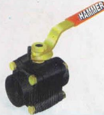
3 PIECE BALL VALVE

M.O.C. : ASTM A105 / ASTM A182GR, F304 / F316 MFG STD. : BS 5351 / API 602 TESTING : BS 6755 / API 598 DESIGN : 3 Pcs / Fullbore / Reduce bore END : Screwed BSP / BSPT / NPT / Socketweld to ANSI B16-11 RATING : 800# SIZE : 15MM to 50MM