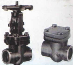
GATE / GLOBE NRV

M.O.C. : ASTM A105 / ASTM A182GR, F304 / F316 MFG STD. : API 602 / BS 5352 TESTING : API 598 / BS 6755 DESIGN : Screwed BSP / BSPT / NPT Socketweld to ANSI B16-11 RATING : 800# SIZE : 15MM to 50MM